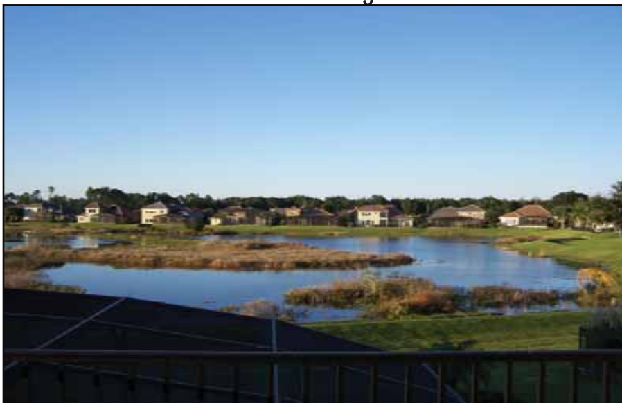
Lake View from the balcony

Property Facts Bedrooms/Baths - 4/4 Heated Square Feet - 3,696 Year Built - 2004 Monthly HOA - $167.00