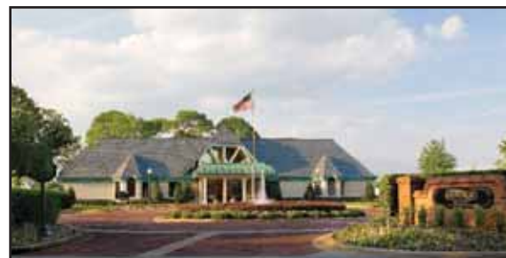
Heathrow Realty Sales Center

1275 Lake Heathrow Lane Heathrow, FL 32746 407-333-1400 www.HeathrowRealty.com