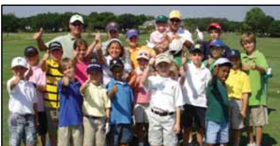
Heathrow Country Club Kids Camp