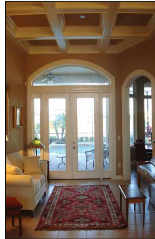
Formal Living Room

Features ~ Custom built home by Hillcrest ~ New Circular Paver driveway ~ Oversized 1/2 acre lot on Lake Irish ~ 3 car side entry garage ~ Downstairs main living with views of the lake from almost every room ~ Upstairs 4th bedroom & a Bonus room with full bath ~ Exquisite built-in cabinetry ~ Gourmet kitchen with granite counter tops, 42" cabinets, center island ~ Oversized screened and paved lanai with pool and spa ~ Irrigation system ~ Spacious Master Suite and luxurious bath with separate shower