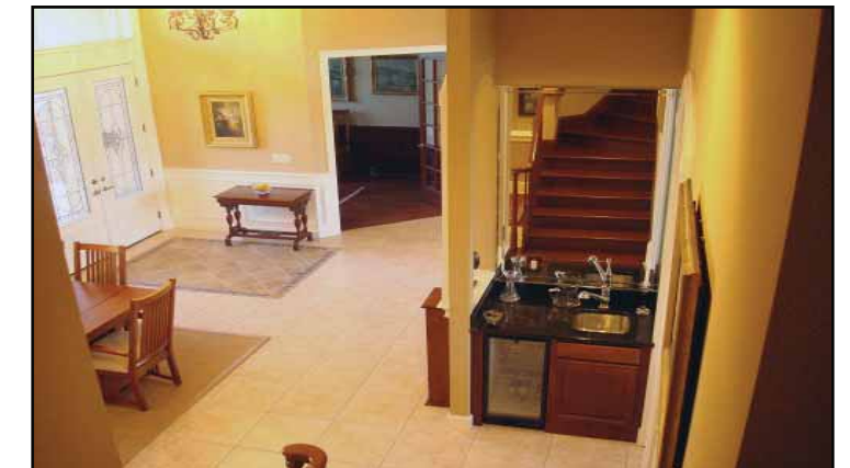
View from Stairs - Foyer