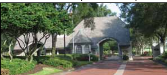
Heathrow's 24-hour Manned Gate