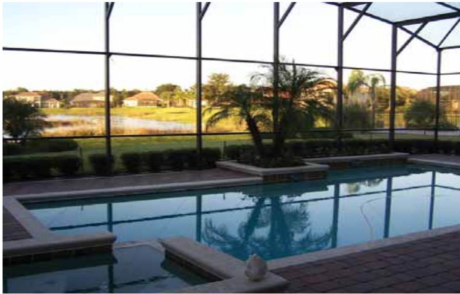
Large Screened Patio with Pool & Spa