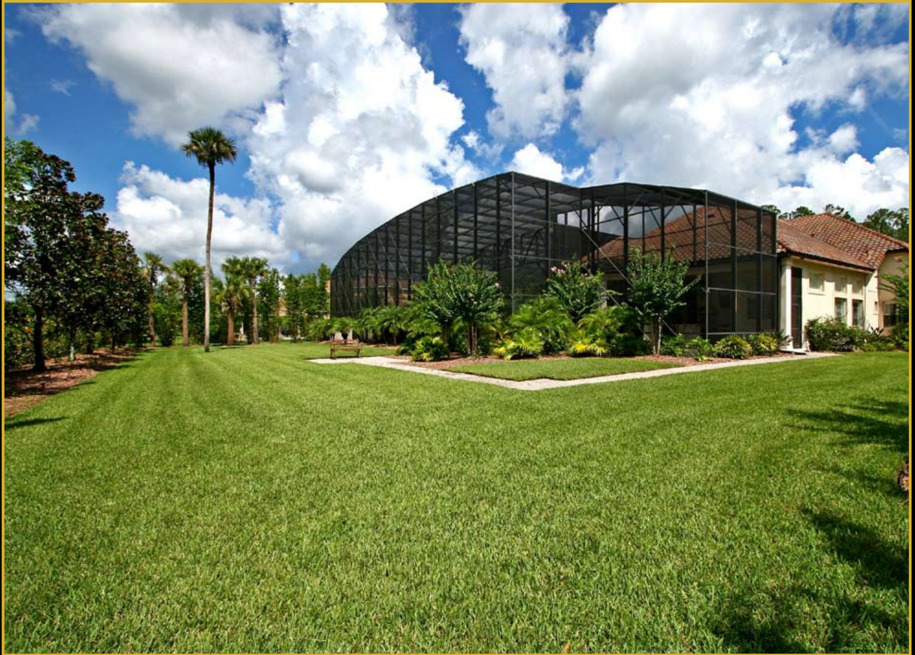
Beautifully landscaped one acre lot