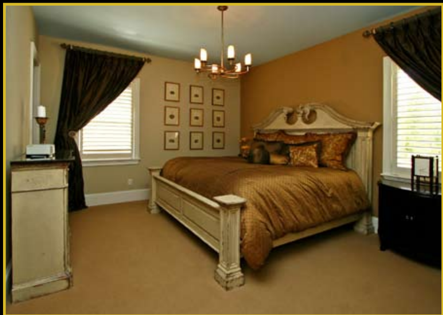
Second Master Suite