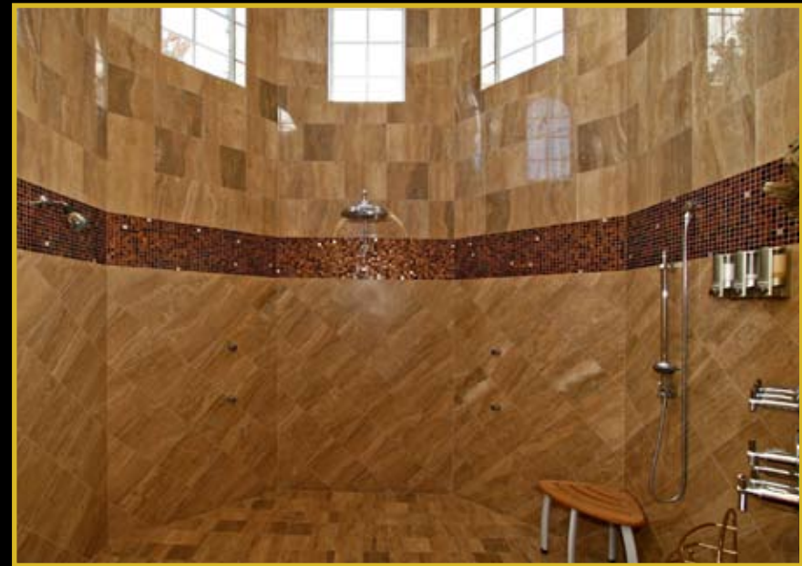
Travertine Master Shower