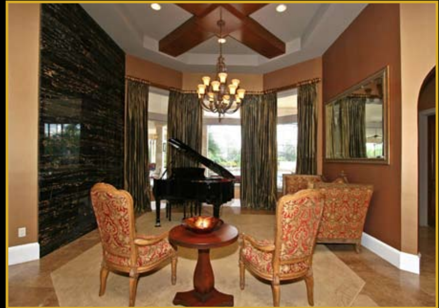
Formal Living Room