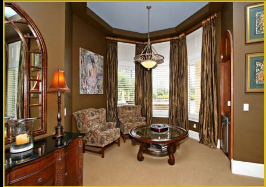
Master Sitting Area