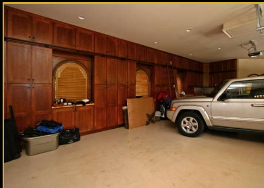
Custom 4 Car Garage