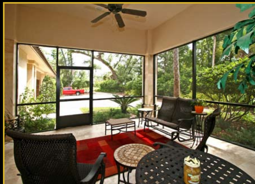
Screened Sitting Area