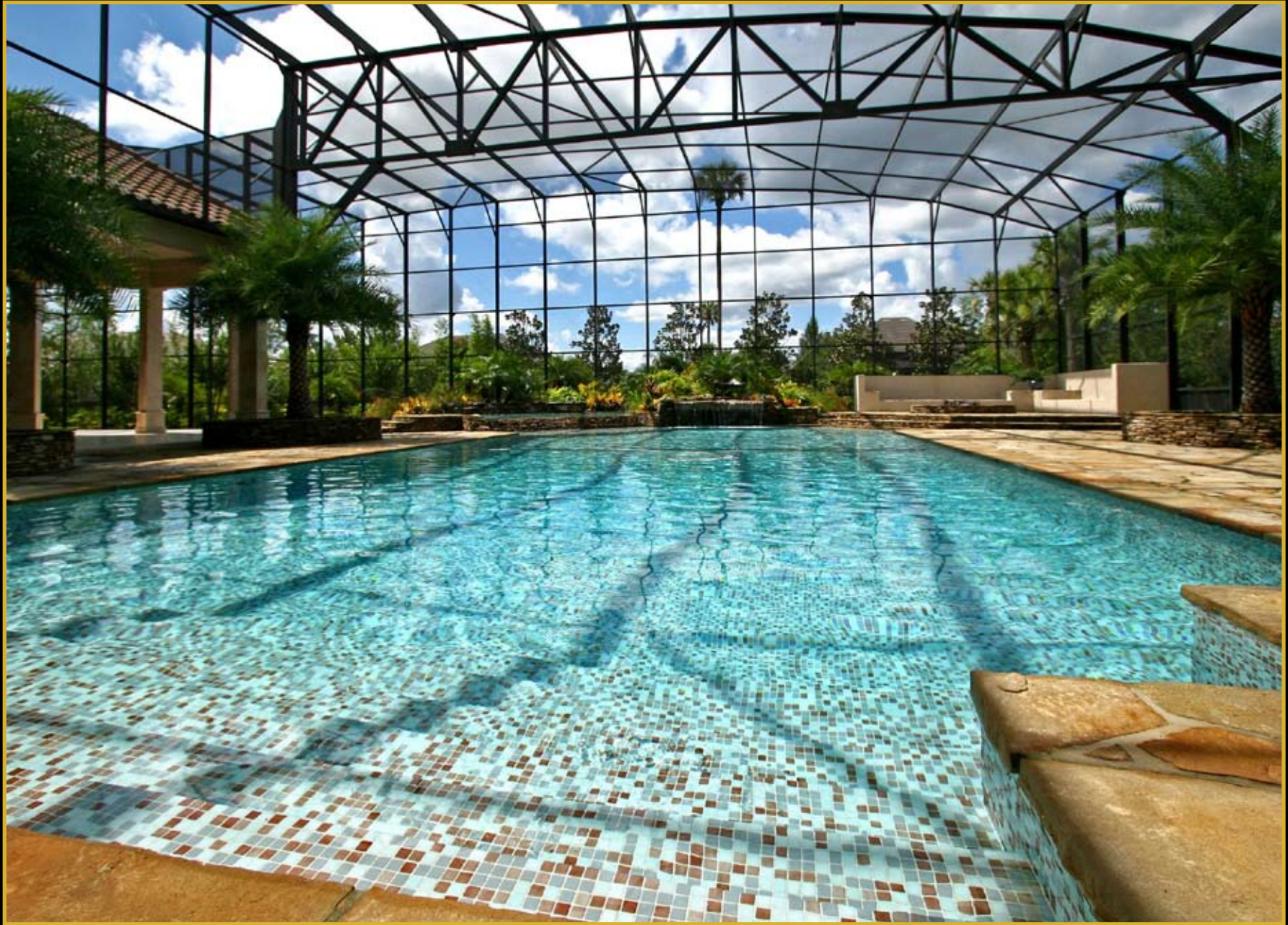
Large glass tiled pool with waterfall and spa